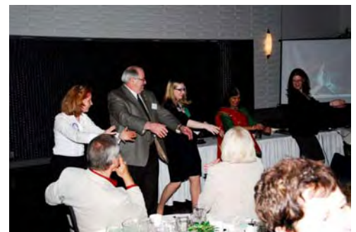
Dancing with 4 attractive young women. The president's job is never easy!