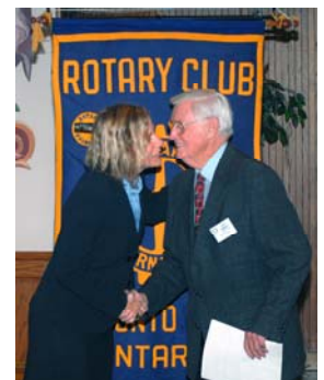
Something new in the induction process??