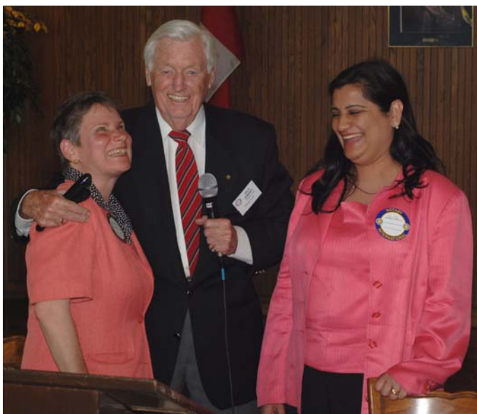
Two unsuspecting ladies who have no idea the Toronto East Kissing Bandit is about to claim two more innocent victims.