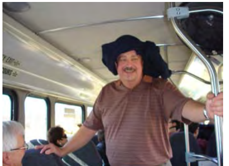
World's worst bus highjacker