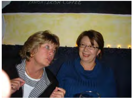
Sure you can laugh... You're not married to him!