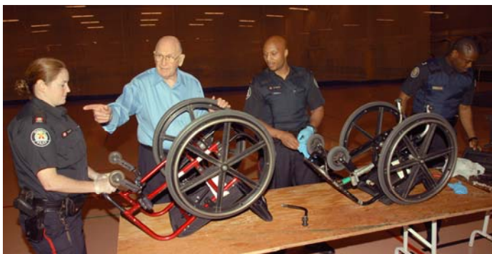
Some of Toronto's finest