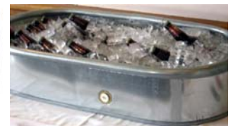
A tub full of Wellys on ice.