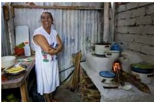
This Honduran woman lost her home after Hurricane Mitch. A microcredit loan has her back in business selling plantains in San Juanito.