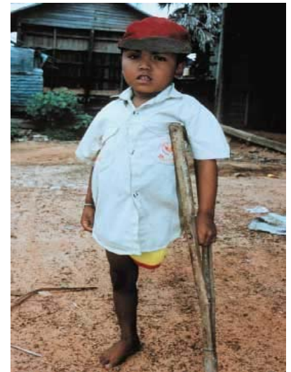
When the land is clear, We walk without fear.

A $20 charitable income tax receipt will be issued to the purchaser of each ticket.