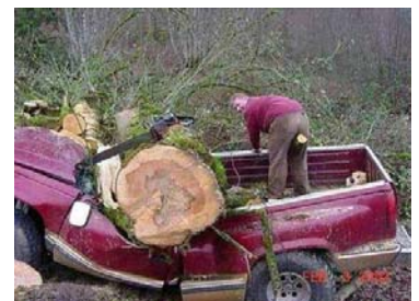
Planning is important